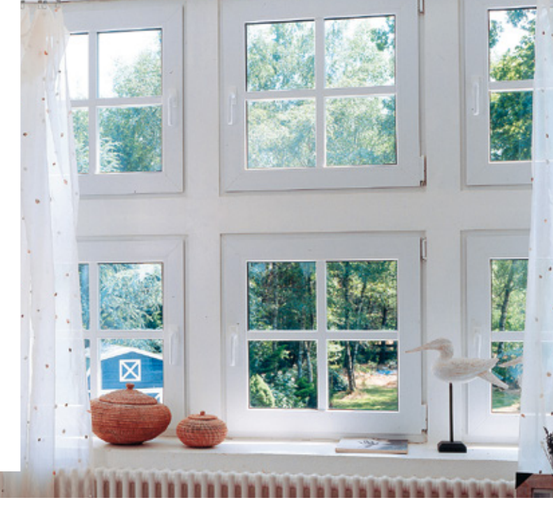
2-part-casement window, recessed